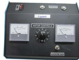
Control panel for rotation of the launcher