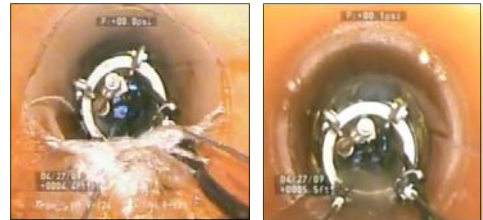
Minimal residual grout ring remaining

Maintenance and spare parts are kept to a minimum to ensure that time is spent in the field and not in the shop.