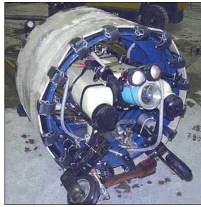
FIGURE 4: HD2, the delivery system, with the modified Logiball packer as an external frame.

The first grout injection was completed in less than two hours, including flushing of the lines. Divers left the packer in place for eight hours. When it was removed, the ROV cameras revealed a perfect repair, but on the edge of the joint.