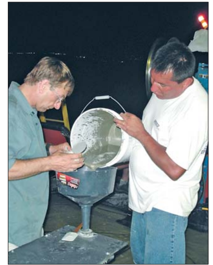
Doing the main repair at night meant cooler temperatures and calmer weather.

After the line was recommissioned, a final inspection confirmed that no effluent was leaking from the repaired joints. Grout stains were visible on the outside of the pipe, and numerous small fish were congregating under the grout mattress, an excellent indicator that the water was uncontaminated. ■