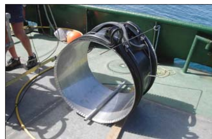
FIGURE 2: The ROV with modified packer from Logiball (upper) and a grouting sleeve from Link-Pipe (lower).