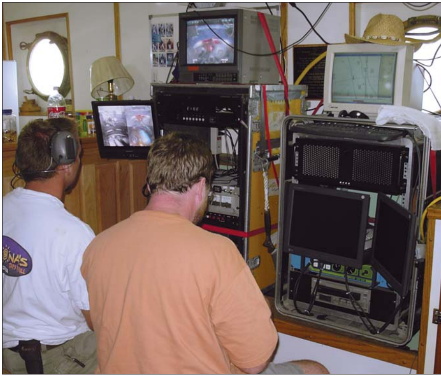
FIGURE 3: The ROV pilot (left) at the control consoles inside the tugboat uses three monitors. The one to his left is a multiple display, three for the ROV cameras and to display the positioning system for the boat. It shows the boat's location on a navigation chart and includes anchor positions. The middle monitor is the primary camera display and the one on top of the console is the permanent navigation display.

“The joint at location 2 was misaligned by 3 inches and beyond the tolerances of the repair sleeve. The rough finish of the spun concrete lining exacerbated the condition.”