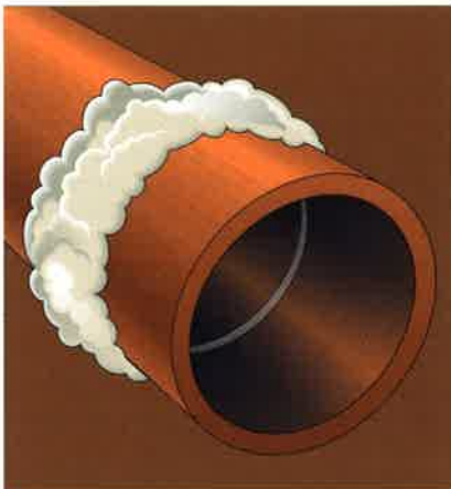
■ CHEMICAL grout forms a flexible, watertight collar around a pipe joint.

C hemical grout has been used successfully for more than 30 years to stop leaks in sewer systems. However, not all installations have been equally successful. To find out why some installations are more successful than others, we interviewed directors of public works, consulting engineers, grout contractors, suppliers, and equipment manufacturers.