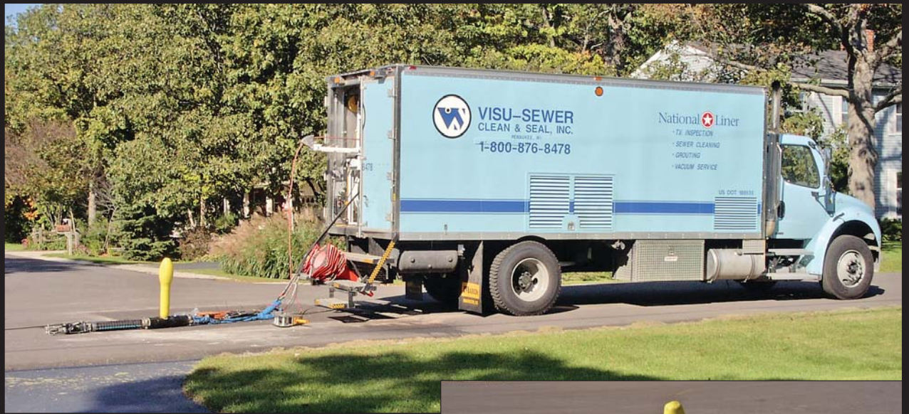
A lateral packer system from Logiball Inc. is deployed on a grouting project. Grouting and CIPP lining were the city's preferred methods of sealing lines against I/I.

Joe Hastreiter is a freelance writer/photographer based in Kewaunee, Wis. ♦